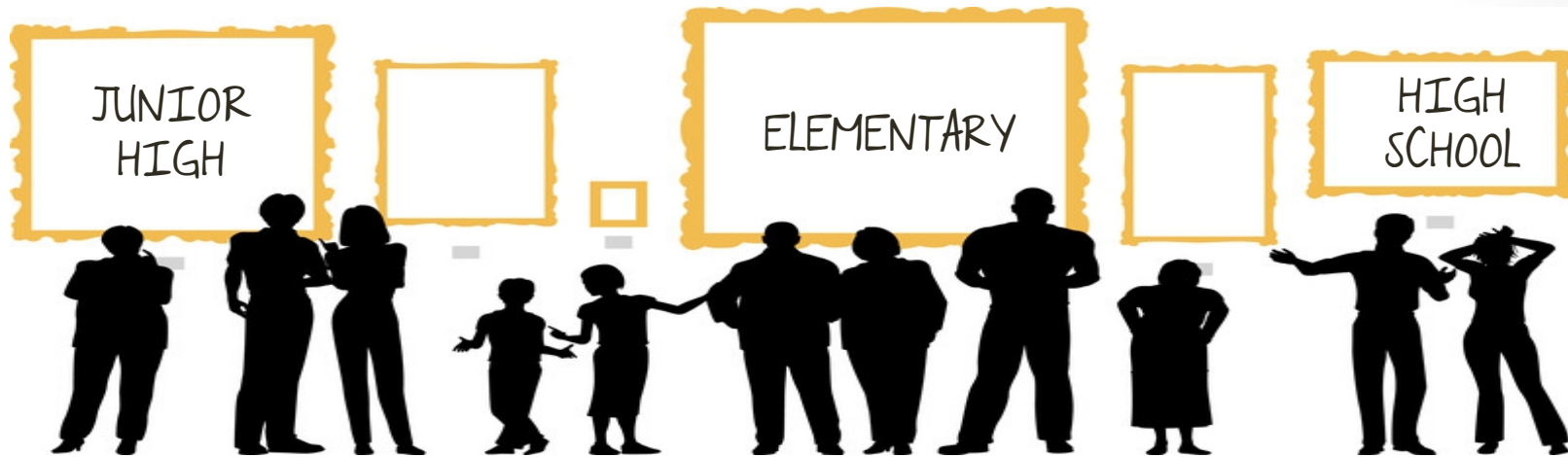
Table Talk: Gallery Walk Observations